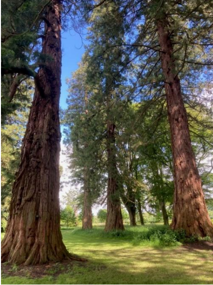
Giant Sequoias at Dumfries House.