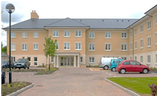
Homestead MHA, Carterton